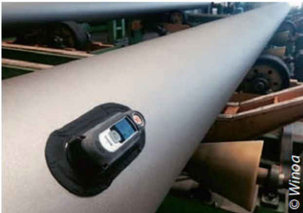
Practical use of the measurement device enables optimised blasting times by preventing the over - blasting

Areas of application for the new measuring device are primarily production and quality control fields. However, external monitoring or testing during an audit can also be performed with the mobile, battery-powered system.