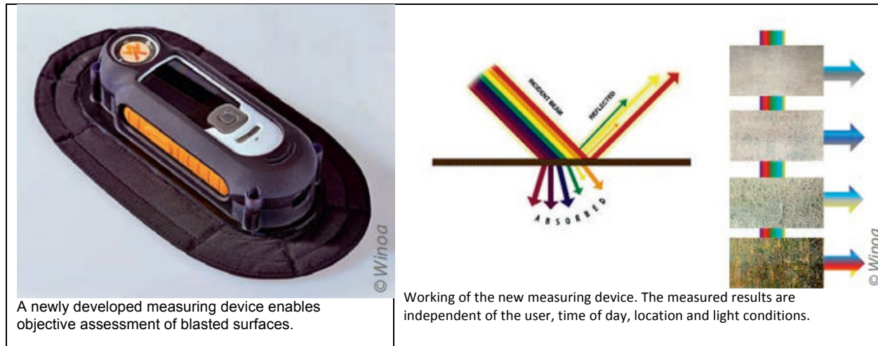
A newly developed measuring device enables objective assessment of blasted surfaces.